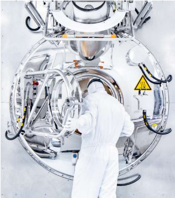
The state-of-the-art cleanroom environment contributes to producing components with the lowest endotoxin, bioburden, particulate, and defect levels in the industry.