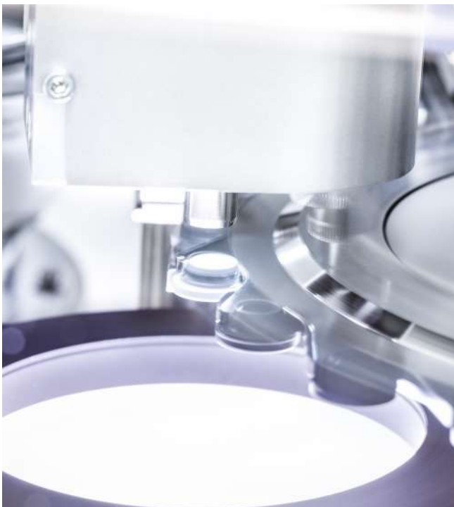
The FirstLine® concept includes high-level camera inspection to detect and remove defects before Datwyler's products are packed and shipped to its customers.