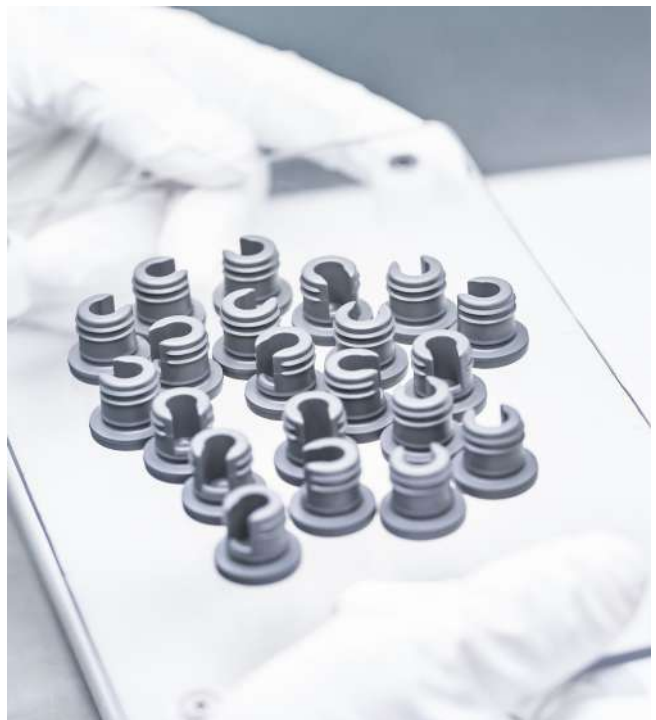
Datwyler's way of living a zero-defect philosophy: FirstLine®.